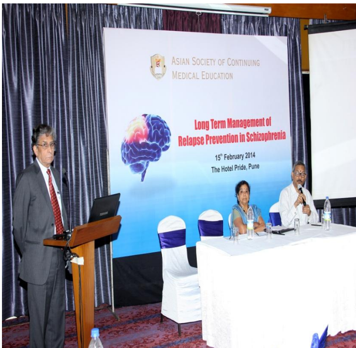
Faculty & chairpersons answering