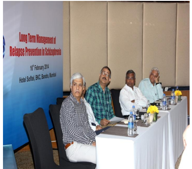
Chairpersons & Panelists interacting