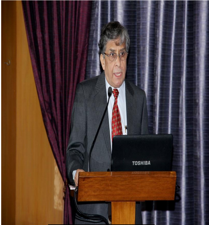
Faculty giving lecture