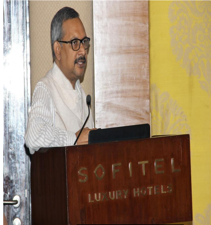
Faculty giving lecture