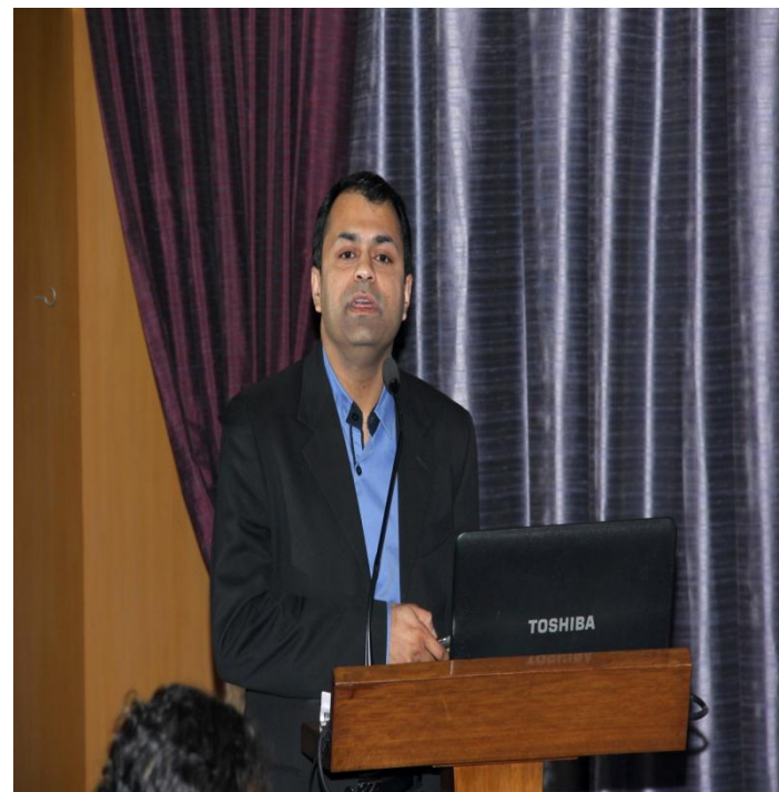
Faculty giving lecture