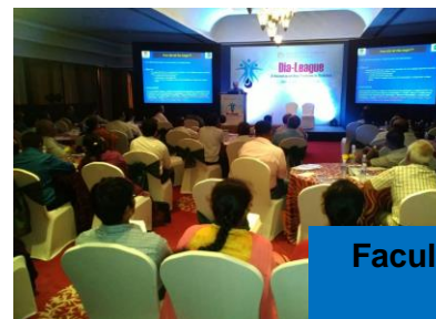
Faculty Delivering the Lecture

Dia League CME in the Western region were conducted on 21 st June 2015 at Hotel Radisson Blu, Nagpur that invited well-known Diabetologist, Endocrinologist and CPs across India to discuss on several essential aspects of pediatric nutrition. This event included of lectures, workshops and discussion of clinical cases delivered by experienced faculties. Treatment guidelines were established by diabetes experts and community practitioners. Clinical cases of Diabetic patient with recurrent hypoglycemia and increased BMI on a failing dual therapy of MET + SU and Newly diagnosed diabetic with very high level of PPG, rich carbohydrate diet and sedentary lifestyle. Active participation of the partakers led for sharing professional experience and ideas which helped them to gather apt information related to management of Diabetes.