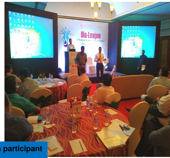
Discussion with participant