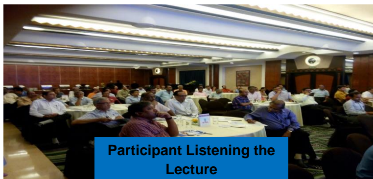
Participant Listening the Lecture