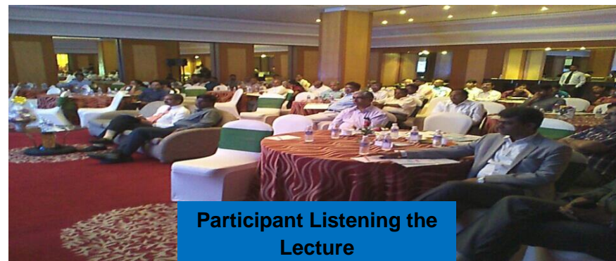
Participant Listening the Lecture