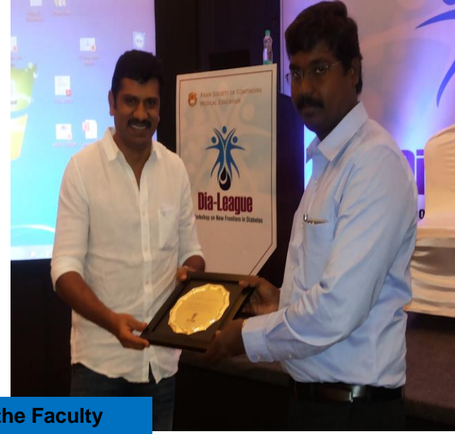
Felicitating the Faculty