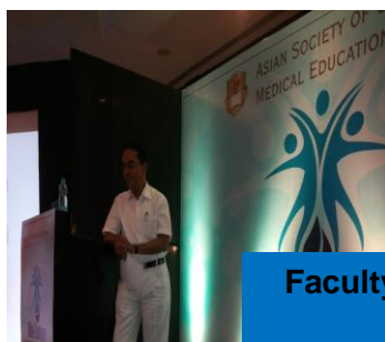
Faculty Delivering the Lecture

Dia League CME program was conducted in the Eastern region on 21 st June 2015 at Hotel The Park, Kolkata that invited renowned Diabetologist, Endocrinologist and CPs across India to talk about several practical and clinical issues related to Diabetic Management. In these CME programs, lectures and workshops were included that were based on Debate on What OAD to choose after Biguanide Class Drug as an initial therapy fails - Against DPP4 Inhibitor and for DDP4 Inhibitor. Also Ambulatory glucose profiling-Novel concept, promises improved diabetic patient outcomes and its role in today world were discussed critically. Clinical cases discussed by the participants helped them to understand clinical features and practical insights based on Diabetic Management.