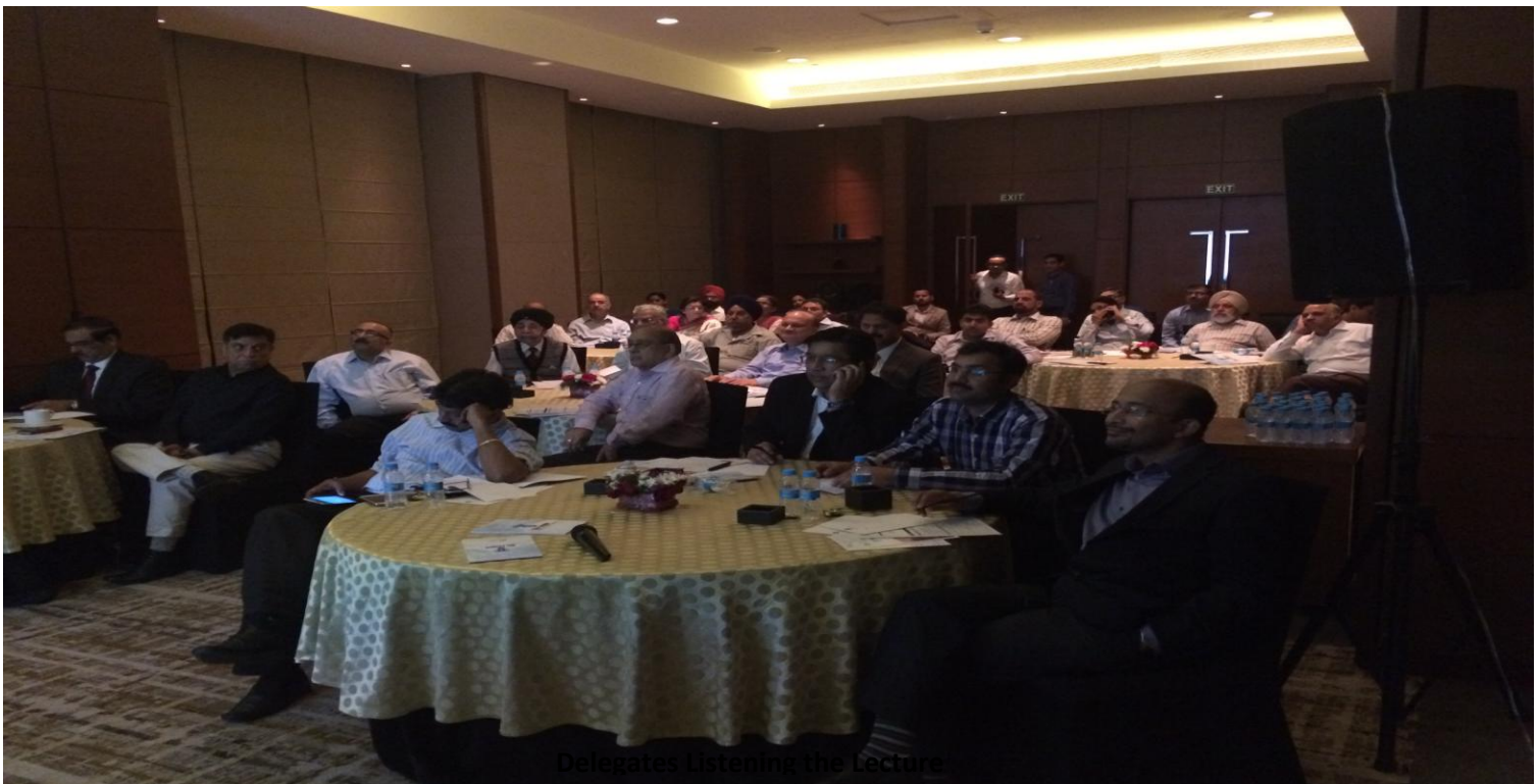
Delegates Listening the Lecture