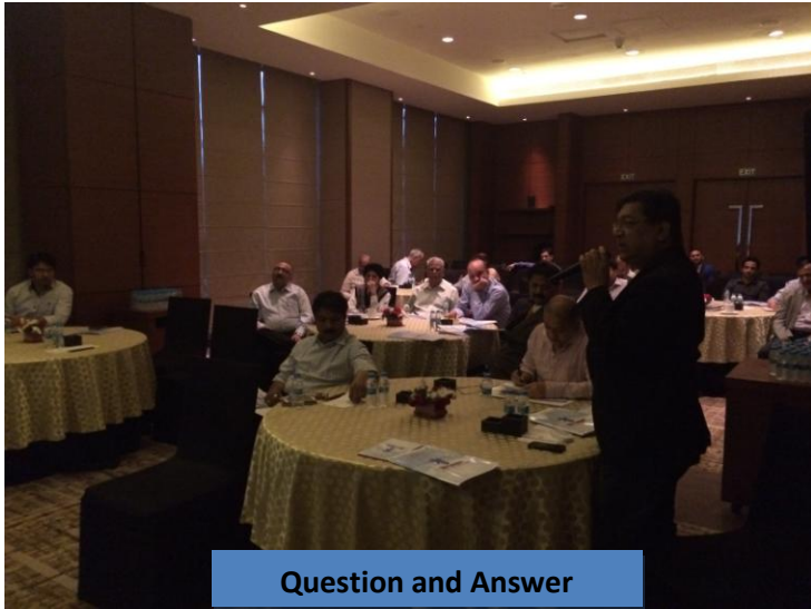
Question and Answer