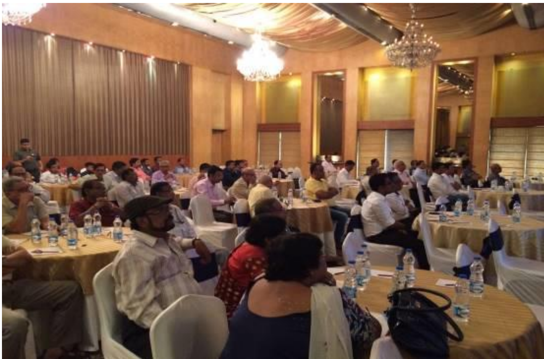
Participants Listening the Lecture