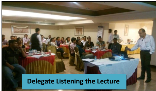
Delegate Listening the Lecture