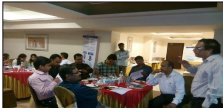
Faculty and Participant discussion

Participants were keen to share their experience and knowledge and they also provided their critiques and recommendations on the event.