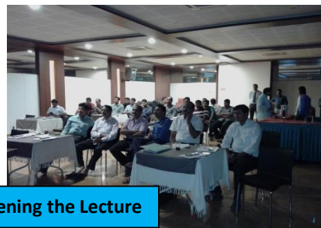
Delegate Listening the Lecture