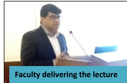
Faculty delivering the lecture

DFEP were organized in the Southern region at 04 Places i.e. Vizag, Vijayawada, Cochin, Mysore respectively which invited renowned Consulting Physicians and Diabetologist across India to share their knowledge about several practical and clinical issues related to Diabetic Foot Ulcer. In this CME program, lectures, Live case study and Debate were included which were based on Management and complication of Diabetic Foot Ulcer. Towards the end of the program participants shared their feedback, concerns and suggested topics for future programs.