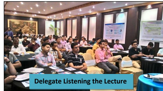
Delegate Listening the Lecture