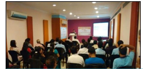
Faculty and Participant discussion