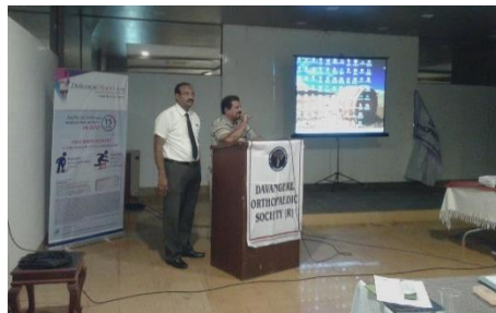
Faculty Delivering the Lecture