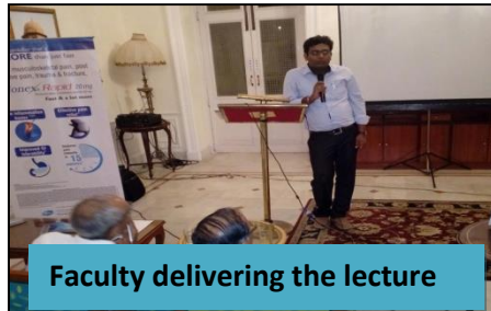
Faculty delivering the lecture